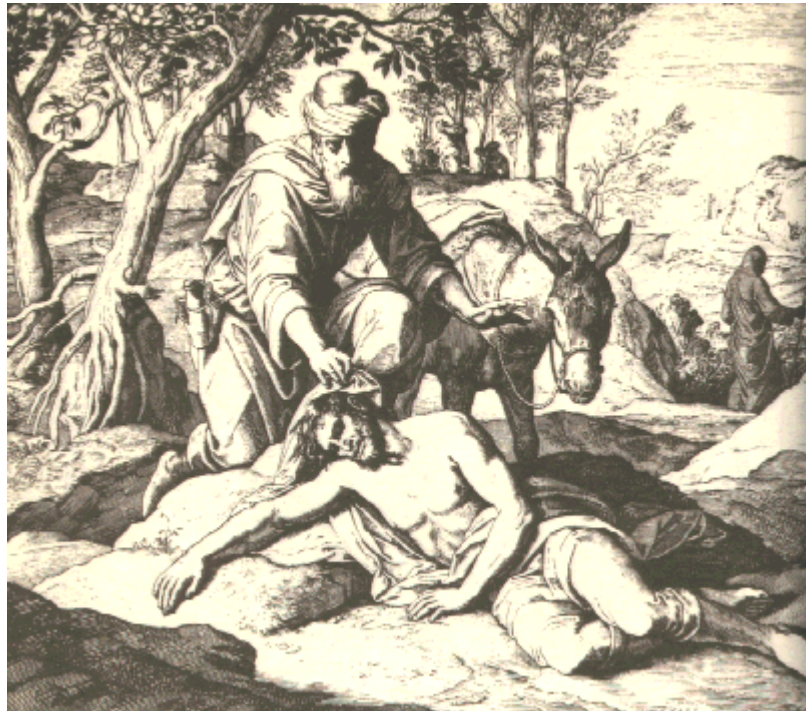
"The Good Samaritan"

"No matter who you are or where you are on life's journey, you're welcome here."